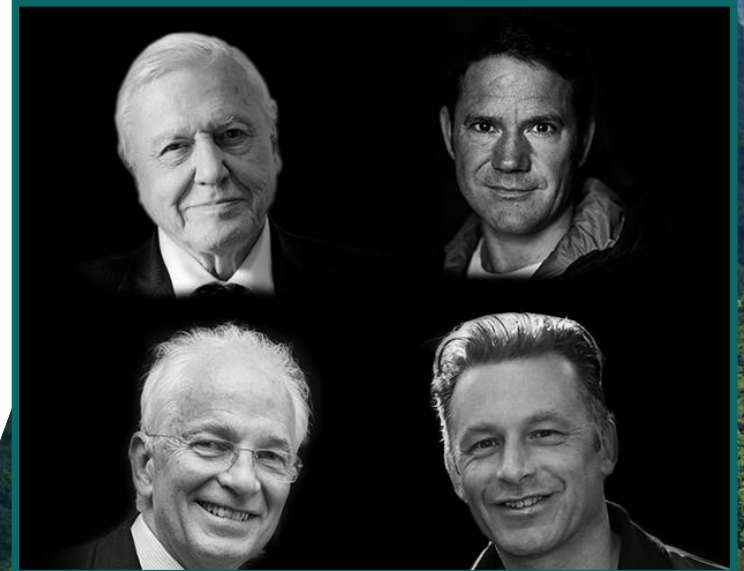
World Land Trust's patrons include: Sir David Attenborough, Steve Backshall, David Gower, Chris Packham