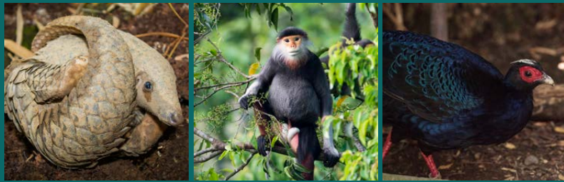
Protecting species in Vietnam: The Sunda Pangolin, Red-shanked Douc, and Vietnam Pheasant are all classified as Critically Endangered