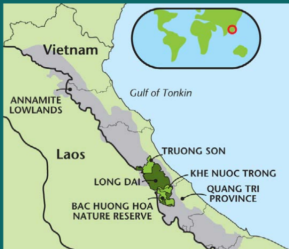
Map of Khe Nuoc Trong, Vietnam